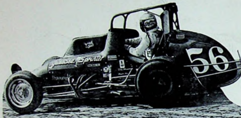
No. 56 - SHELDON KINSER - Feature Winner 3-28-76