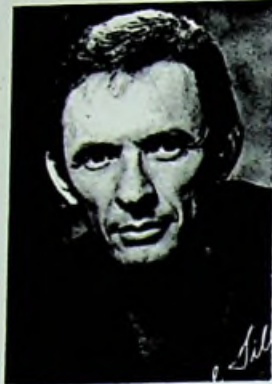
Mel Tillis "Mr. Right & Mrs. Wrong"

Johnny Rodriguez Barbara Mandrell Mel Tillis Bobby Bare & Family