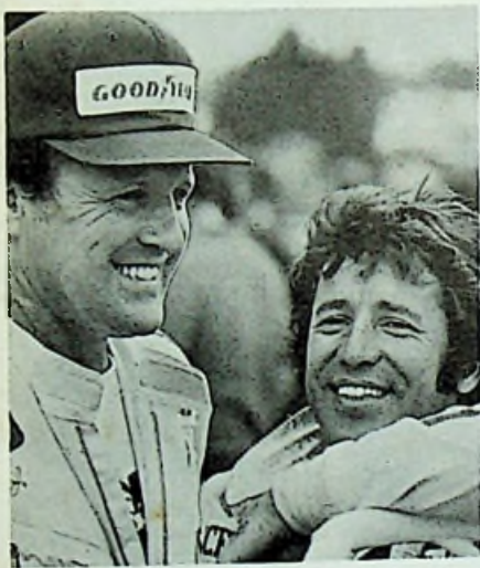
A. J. Foyt congratulates Mario Andretti following his 1974 victory.