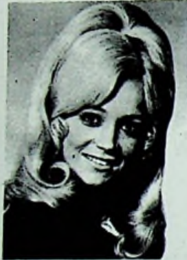
Barbara Mandrell "The Midnight Oil"