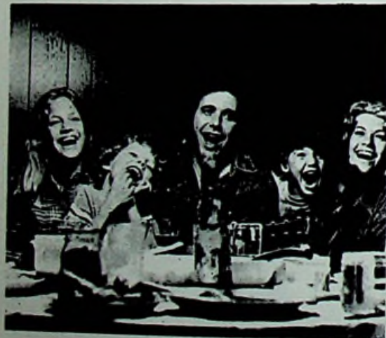
Bobby Bare & Family & "Daddy What If"