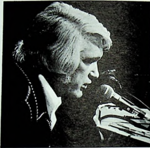
CHARLIE RICH "The Silver Fox"

ONE NIGHT ONLY Monday, August 25 Two Performances — 6 & 9 p.m.