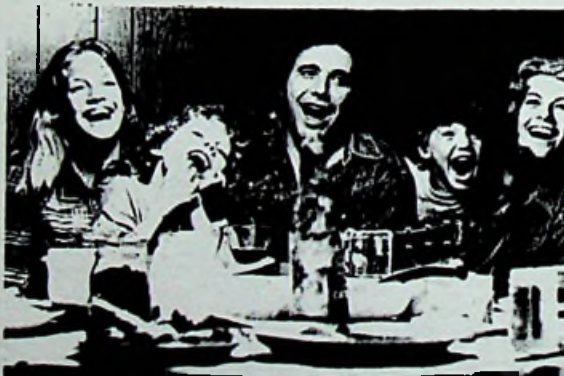
Bobby Bare & Family "Daddy What If"