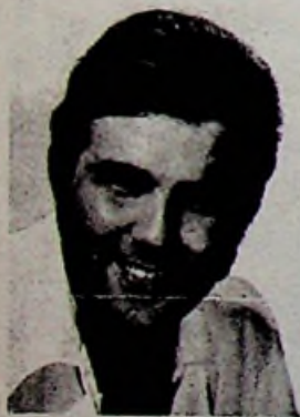
Billy "Crash" Craddock "Ruby, Baby"