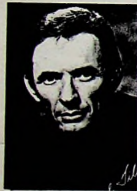
Mel Tillis "Mr. Right & Mrs. Wrong"

ONE NIGHT ONLY Saturday, August 23 8 p.m.