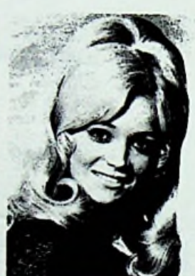
Barbara Mandrell "The Midnight Oil"