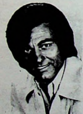
Leroy Van Dyke "Walk On By"