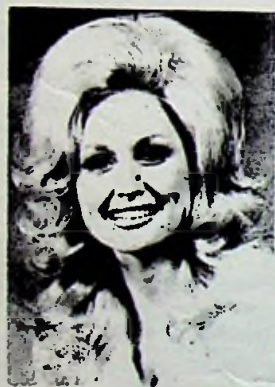
Dolly Parton "The Bargain Store"