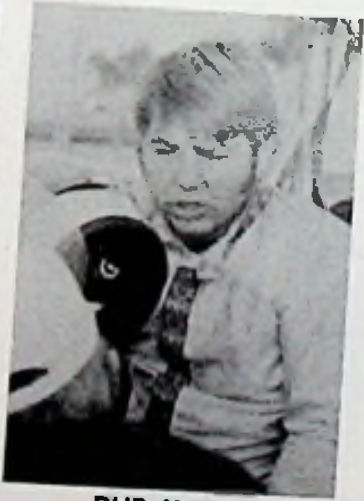
DUB MAY El Paso, Texas